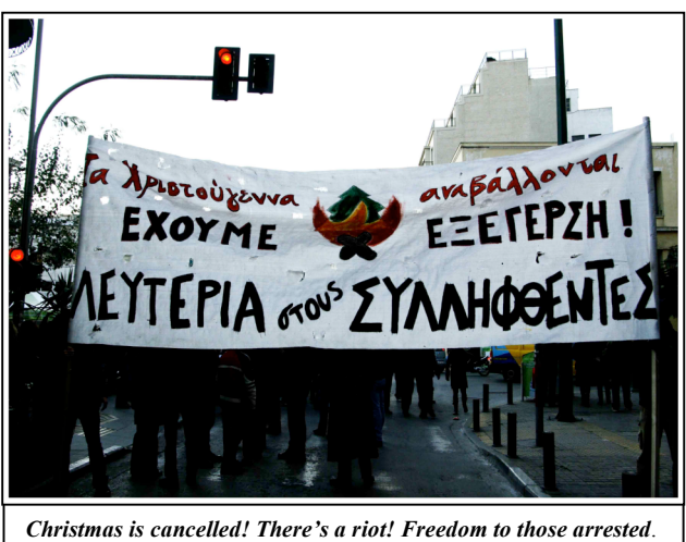
Christmas is cancelled! There's a riot! Freedom to those arrested. From the demo on the 24th December.

More than 1,500 people, mainly from the antiauthoritarian milieu, participated in the demonstration which was organized by the meeting that took place in the occupation of GSEE on Sunday in solidarity with the prosecuted insurgents. The demonstration started from Monastiraki square, passed through Ermou street, reached Syntagma square and then returned to Monastiraki square through Kolokotroni street. Some youths joined the demo which passed through the most