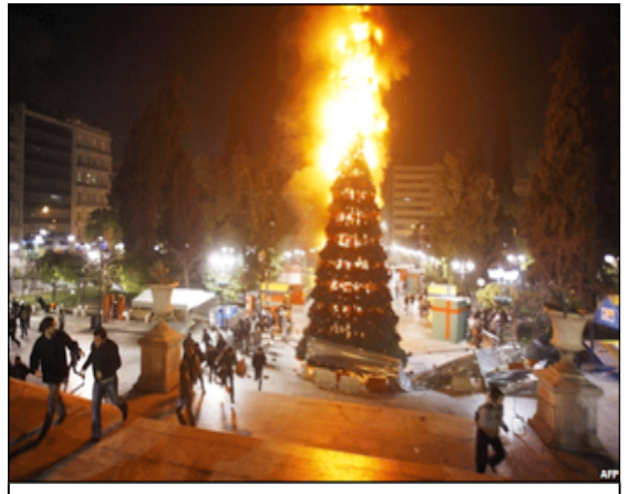
The Christmas tree in Syntagma square is burning, Monday 8.12. Sorry, no Christmas this year, we're having a riot.

At 6pm, the Faculty of Law squat called for a demonstration at Propylaia, a central Square of Athens. Our estimation is that more than 20.000 people, mainly young people, participated in that demo. Lots of them, maybe more than 1.500, were walking "in and out" of the demo smashing banks and destroying the luxurious shops of the city centre. They started to destroy or loot the commodities almost from the first moment of the demo. The youths destroyed banks at Omonoia square and attacked more than half of the shops of Stadiou Avenue and Filellinon Avenue. Also, severe looting took place at the shops in the first blocks of Piraeus